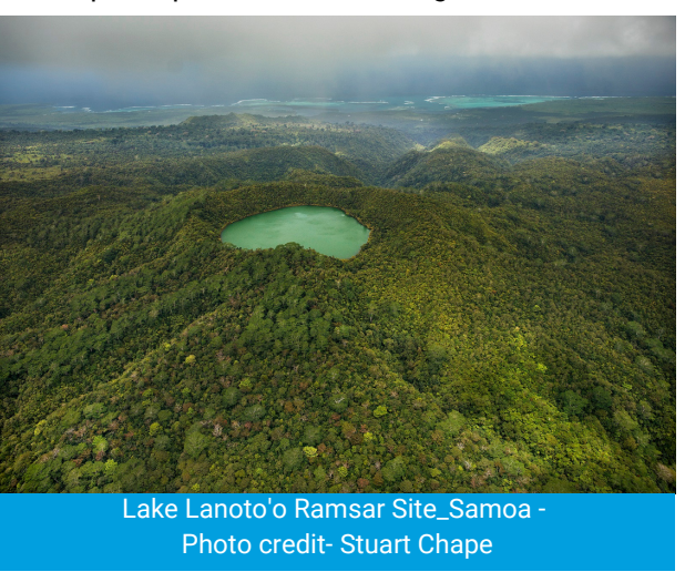
ACP MEAs 3, a selection of planned activities on the Pacific horizon

coming CBD meetings with inputs from Parties and other stakeholders. SPREP through the ACP MEAs 3 programme supported the Pacific delegates on the virtual participation in the 24th Subsidiary Body on Scientific Technical and Technological Advice as well as the SBI 3 meetings of the CBD with access to an internet connection to facilitate their virtual participation in the meetings.