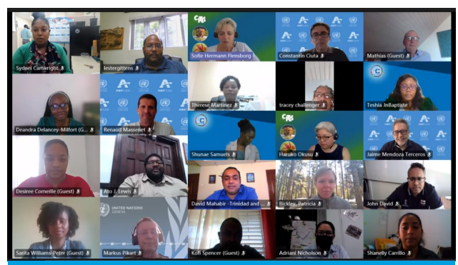
CARICOM and CITES Delegate during a virtual Workshop on 15th June 2021.

support the implementation of the Convention in the Caribbean region on 15th June 2021. The workshop aimed to raise awareness of the potential benefits of automated permitting systems, including the increased transparency and control they can bring to the supply chain and the role they can play in the development of electronic risk management systems.