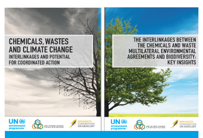
BRS and Minamata's Chemicals and Waste Reports

BRS and Minamata conventions launched two reports on 5th and 21 June 2021 that mapped the interlinkages between hazardous chemicals, wastes, climate change, and biodiversity. The "Chemicals, Wastes and Climate Change: Interlinkages and Potential for Coordinated Action", presents a comprehensive overview of the interrelations among climate change and hazardous chemicals and wastes management, towards identifying opportunities for а coordinated action that simultaneously address the two challenges of the broader sustainability agenda. The second report on the "Interlinkages between the chemicals and waste MEAs and biodiversity: key insights" is inspired by the discussions of a post-2020 ongoing global biodiversity that illustrates the framework interlinkages between the work of the four global conventions chemicals and wastes (Basel. Rotterdam, Stockholm, and Minamata) and the convention on biological diversity (CBD) and other biodiversity-related conventions.