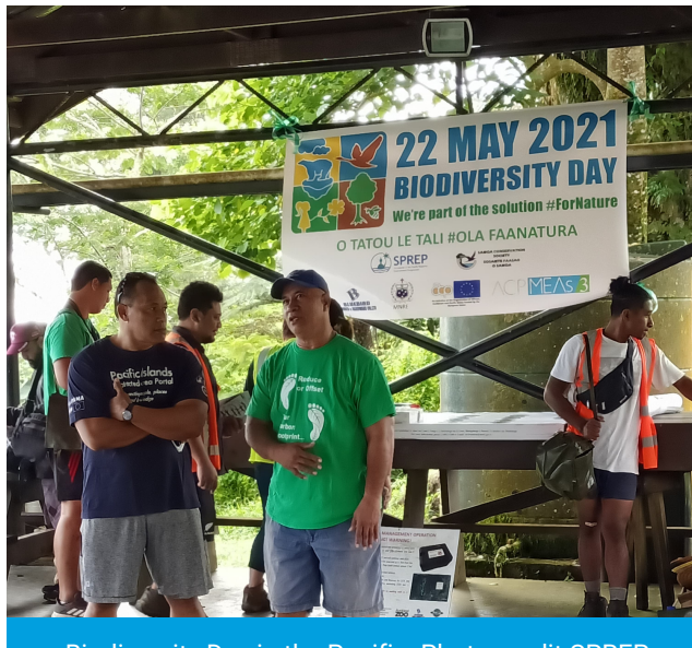
Biodiversity Day in the Pacific.

Improving the understanding of Pacific Islandersabout the richness of their biodiversity particularly the least understood Soil biodiversity is an important topic for the region. In May 2021, the Food and Agriculture Organization, in collaboration with the Pacific Community and SPREP held a virtual preparatory thematic session that brought experts from the Environment and Agriculture sectors together to discuss specific key issues, priorities, and needs to conserve soil biodiversity in the Pacific islands. The session helped the Pacific prepare as the world moves towards a new global framework to halt biodiversity loss under the CBD.