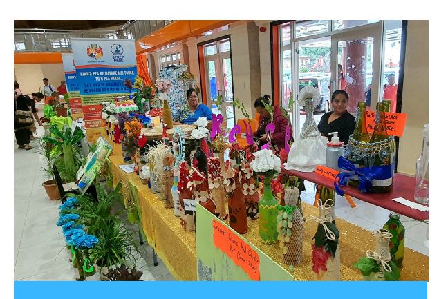
Tonga Environment Week.

In Samoa, the ACP MEAs 3 celebrated World Biodiversity Day in collaboration with Government of Samoa through its Ministry of Natural Resources and Environment, the Samoa Conservation Society, and SPREP. Commemorating the "We are part of the Solution" theme, an open invitation to the local communities in Samoa to visit the Malololelei Recreation Reserve for an interactive tour of the grounds highlighting the work done to protect and conserve species in the reserve. The Malololelei Recreation Reserve was established in 2015 and is home to rock formations that are approximately three million years old, as well as a number of globally threatened IUCN Red listed species including at least five endemic birds.