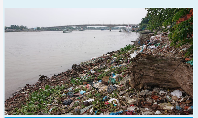
Plastic waste overflowing in Cambodia's Mekong, one of the world's most polluted rivers.

meetings took place for the Asia-Pacific, Africa, Eastern Europe, and Latin America, and the Caribbean regions in May-June 2021. The objective of the online regional meetings was to give Parties in those regions the possibility to hear briefings, exchange views, and consult each other on the items of the provisional agendas of the respective meetings of the COPs that are expected to be considered during the online segment. An approximate total of 437 participants took part in the online regional meetings representing a total of 131 country Parties and 28 observers.