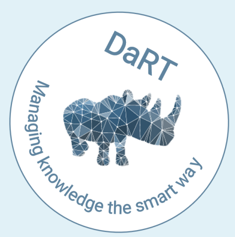
Data Reporting Tool.

Ministries and administrative units in one national working space, enhancing synergies across conventions and increasing the effectiveness of national efforts to achieve global environmental targets.